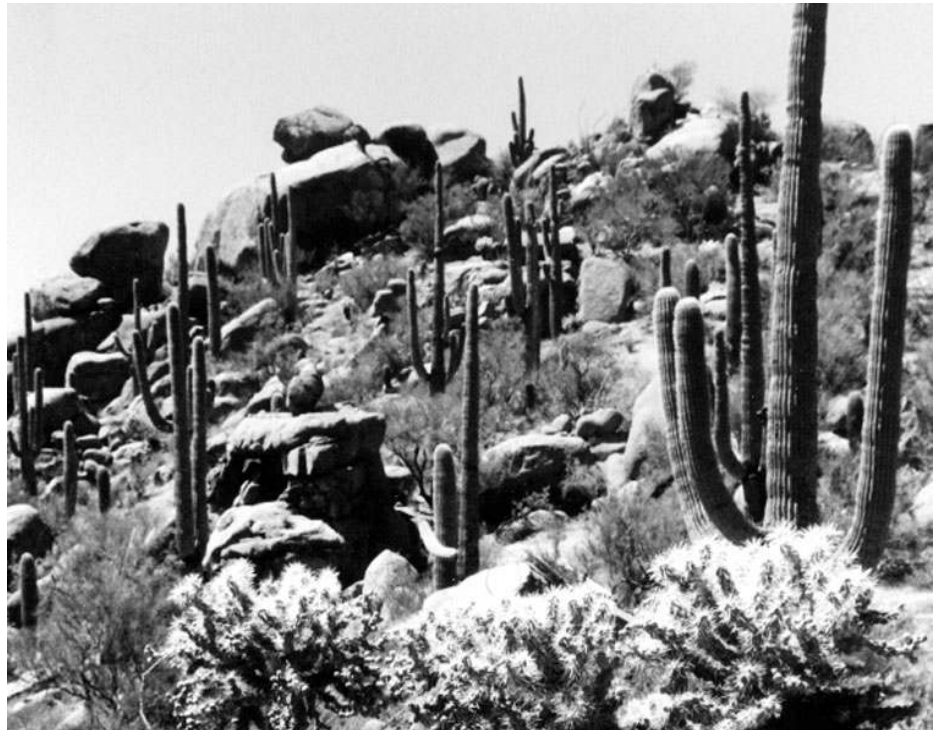
The November 1998 Communities Committee steering committee meeting will be held in Tucson, Arizona, in the heart of the "saguaro forest.".